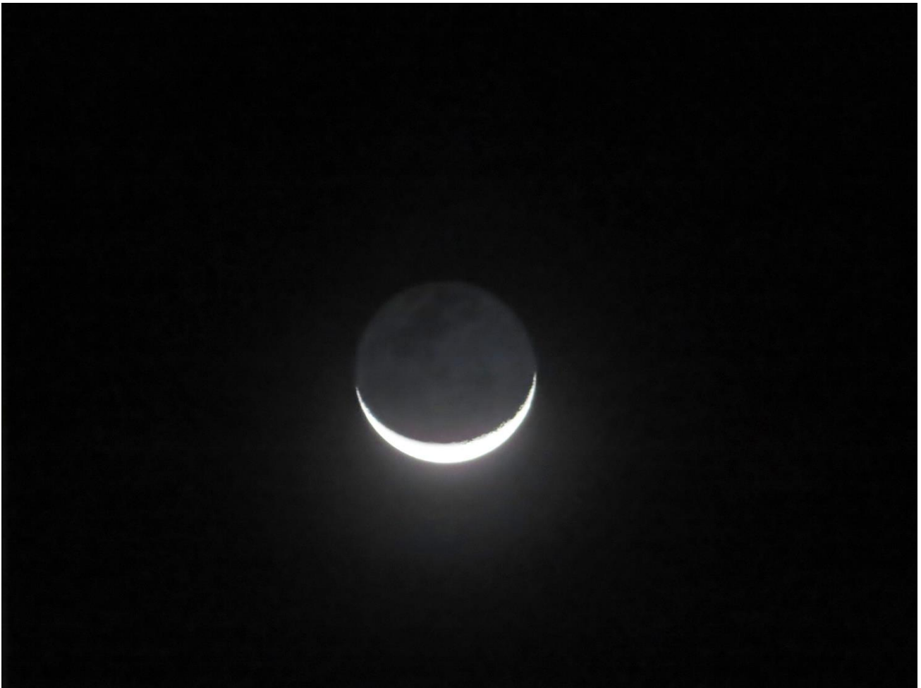
The “old” moon still visible in light reflected back from the earth.

10 Dec 2023, at Quayside Condominium, Penang, Malaysia